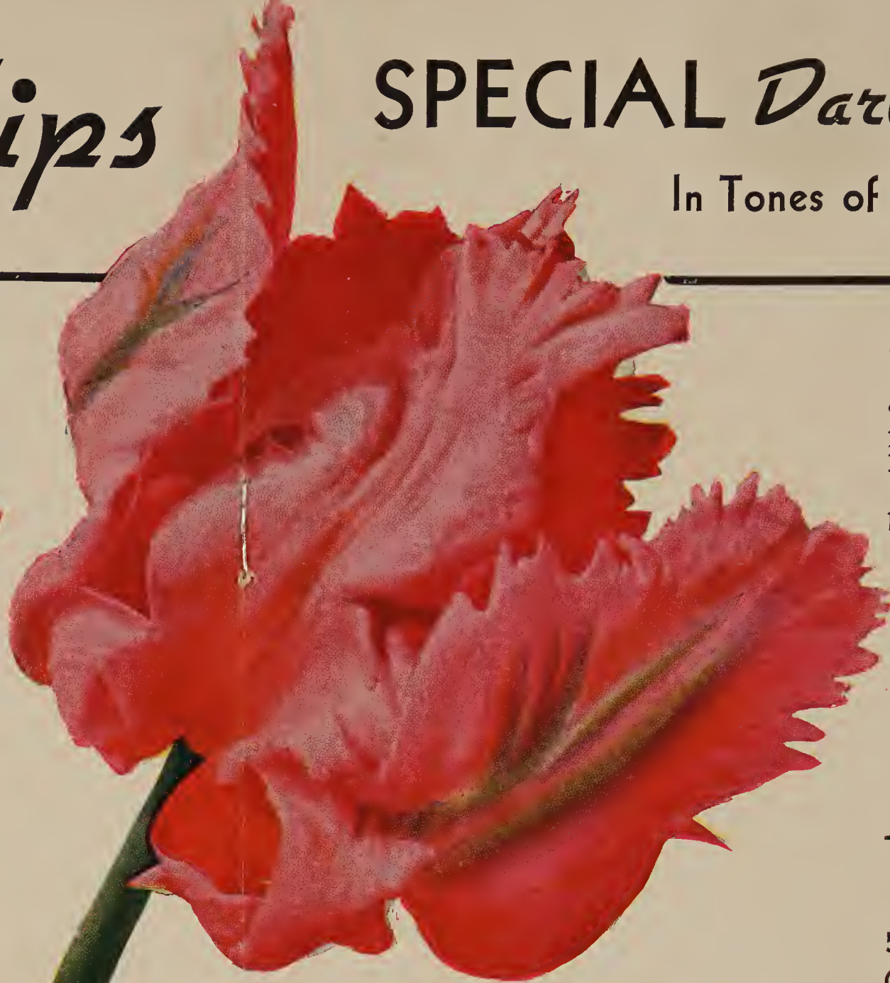
FANTASY 70 cts. for 10; $6.00 per 100 See page 19